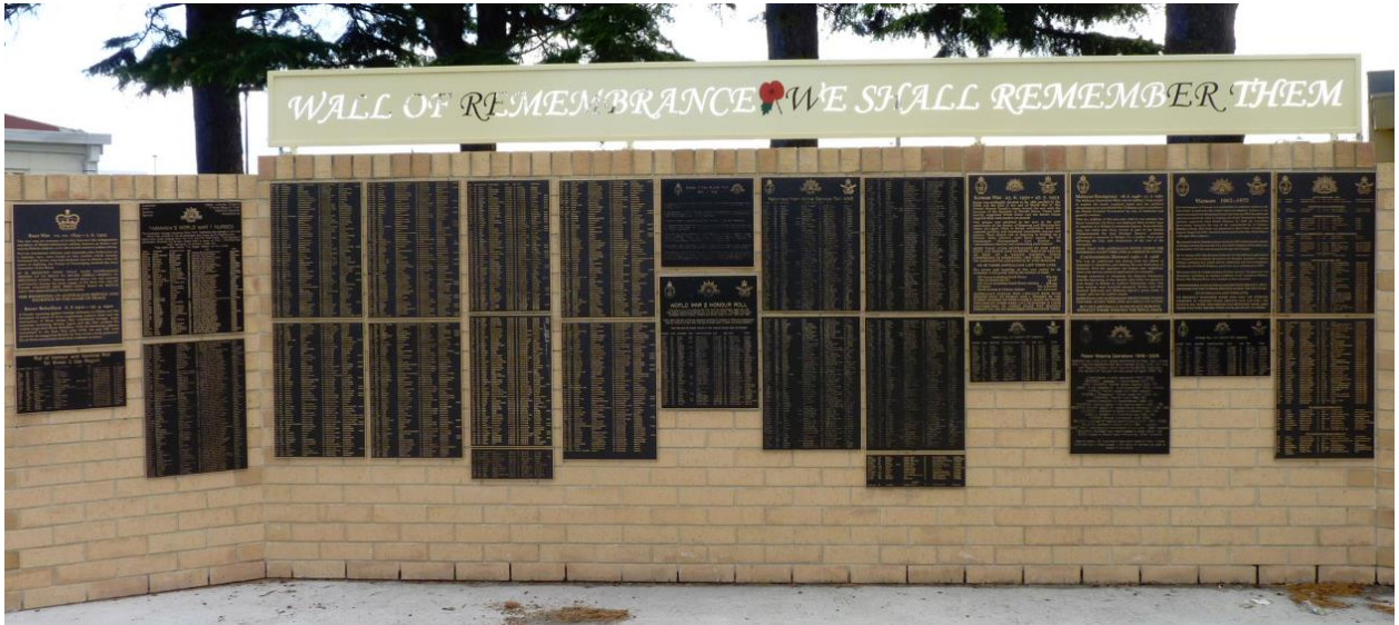
Wall of Remembrance, St. Helens, Tasmania