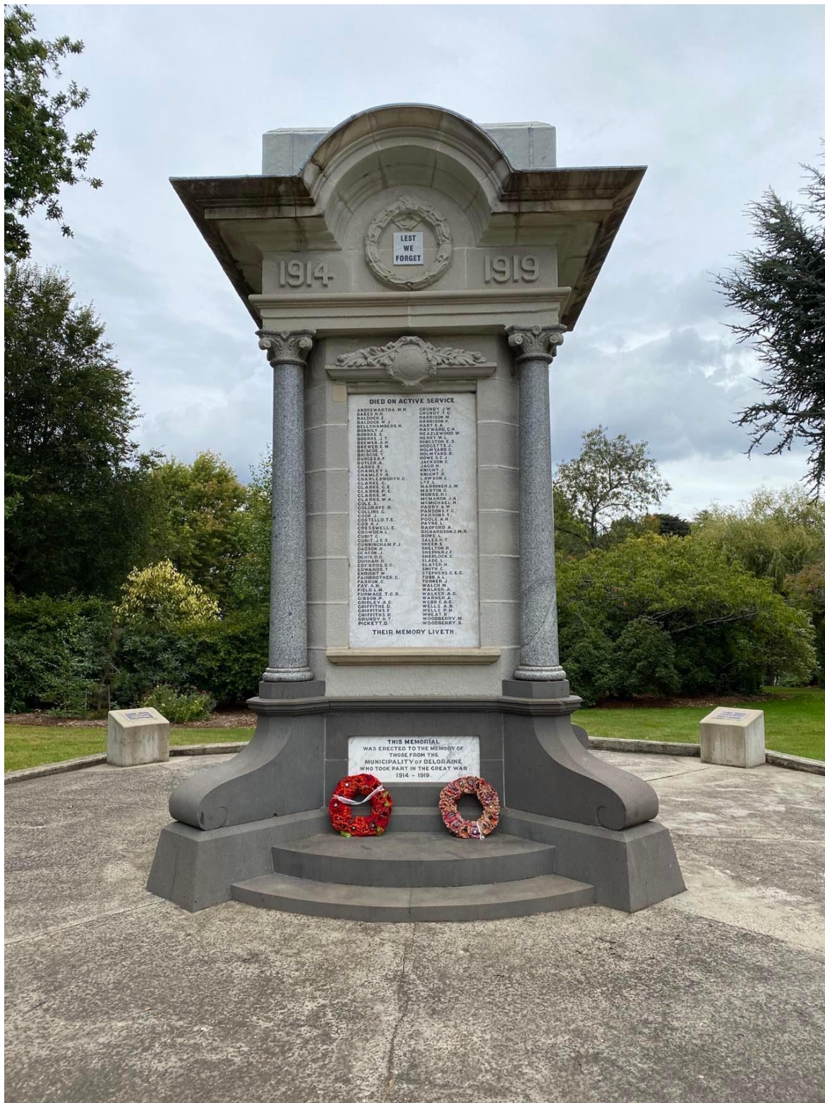
Deloraine War Memorial